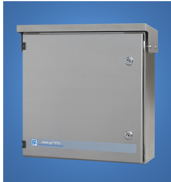
AutoLog® 20AN RTU in IP56 enclosure