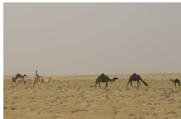
AutoLog® 20AN RTU Systems are operating in wide areas